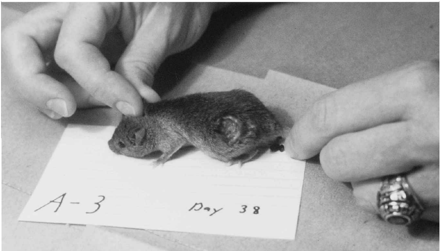
Fig. 5. Thirty-eight days after injection.

Figure 1 (Day 14), the tumor is visible on the left posterior dorsal aspect of the mouse.