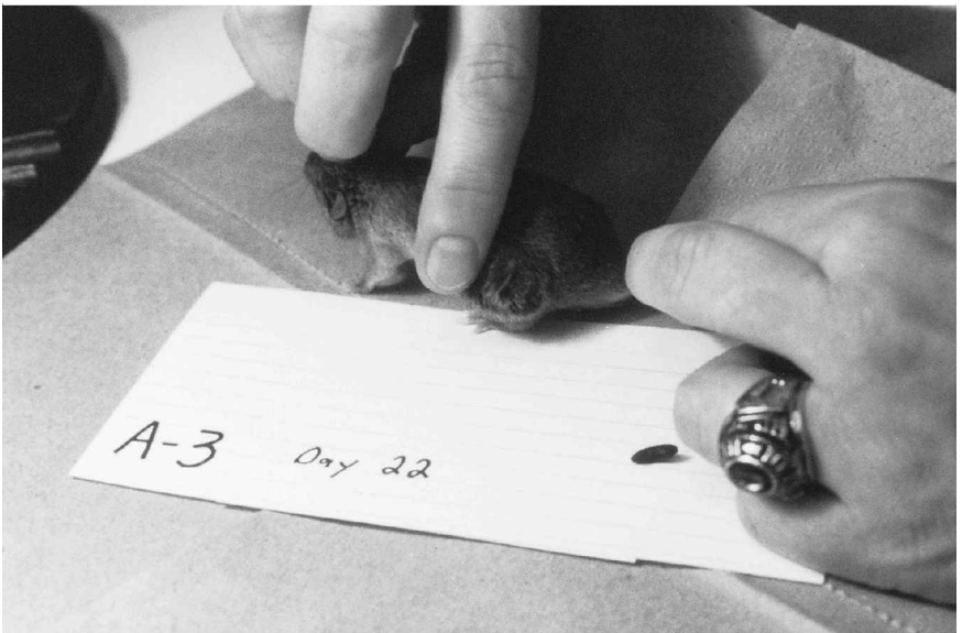
Fig. 2. Twenty-two days after injection.

mors (Figures 1 and 2). At this point, Bengston presumed that the experiment was failing and wanted to call it off. Krinsley convinced him to continue, reasoning that there was nothing to lose. Approximately 1 week later, the blackened areas "ulcerated" as if they had been split open (Figures 3 and 4). In some